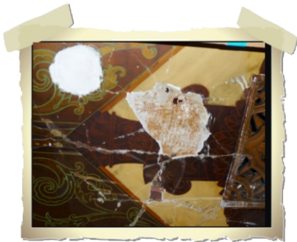
Close-up of damaged ceiling